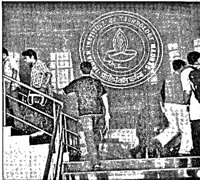
UPGRADING SKILLS: Mission10X was created by Wipro in 2007 to enhance employability skills of engineering graduates

Mission10X was created by Wipro in 2007 to enhance employability skills of engineering graduates. It has so far been extended to 25 states and has trained close to 20,000 faculty members across the country. Mission10X offers a certification programme, which is a layered set of capability building workshops for continuous professional development of teachers of engineering education. Dale Carnegie Certificate in high impact presentations for teachers; Cambridge international certificate for teachers and trainers, and Mission10X learning ap-